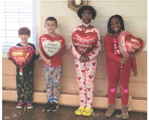
GLC Kiddos and their Valentines.